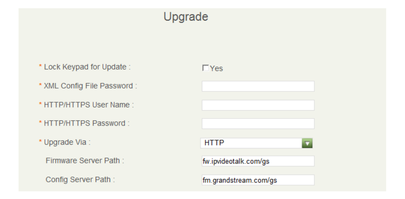
Figure 2: Using web UI to define the XML Configuration File Password

Alternatively, users can also set the XML Config File Password in the web UI of the phone.